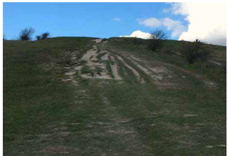
Plough furrows on top of the Beacon