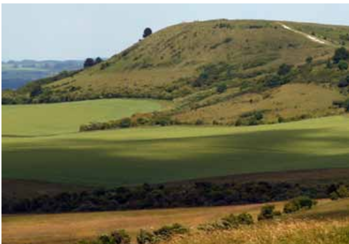
View of the Beacon from the ridgeway

People have 'walked the chalk' here since the Iron Age, for trade, settlement and today for pleasure. But sat upon its imposing chalk ridge, Ivinghoe Beacon reminds us that although some landscapes may seem indomitable and immovable now, they are perhaps more fragile than they first appear.